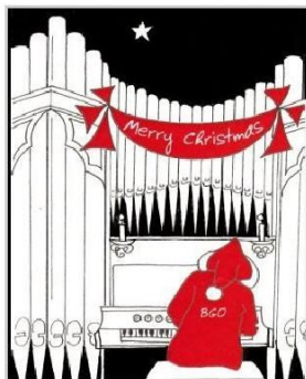
'Organist' 14x11cm message MERRY CHRISTMAS