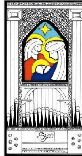
'Holy Family' 21x10cm message HAPPY CHRISTMAS