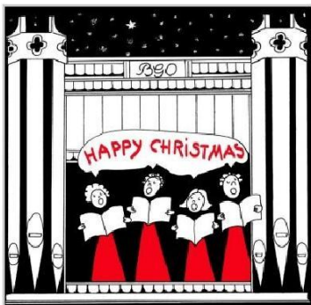
'Choir' 15x15cm message HAPPY CHRISTMAS

To order your cards please contact M Shields on 01573 229015 Mary.shields118@btinternet.com