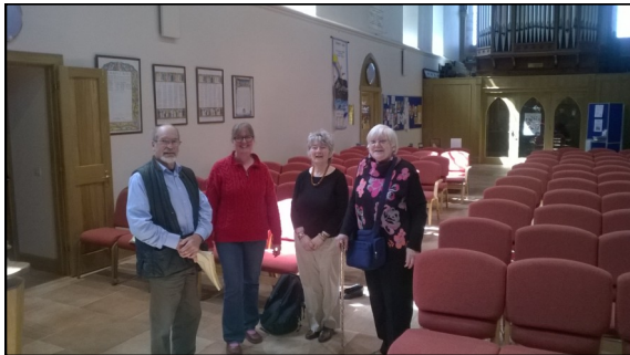
Arrival at Coldingham

First on our itinerary was Coldingham Priory, a very historic place, which has its very early origin in the 7 th century. The existing church is the Choir