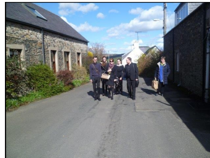
Vintage Twelve arrive in Blainslie