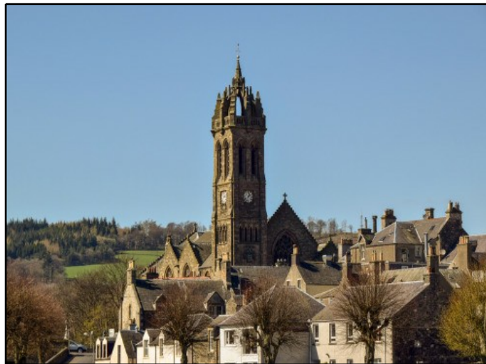
The Old Parish Church, its steeple towering over Peebles